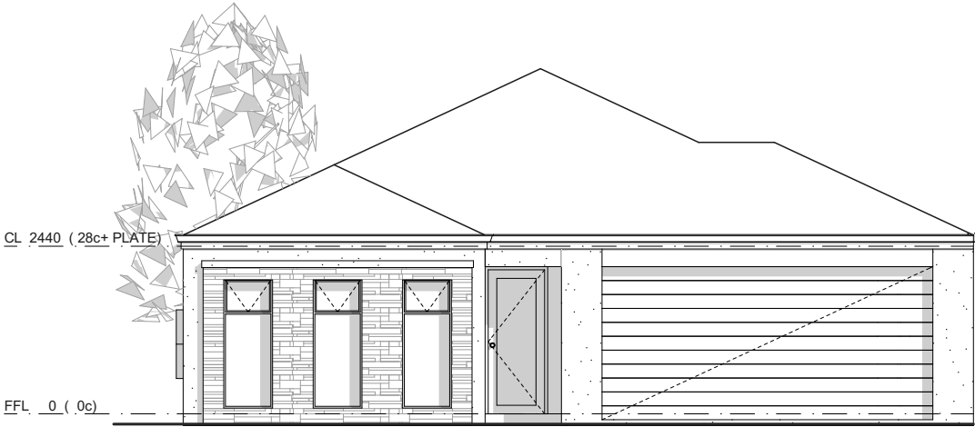
TRADITIONAL ELEVATION 1:100