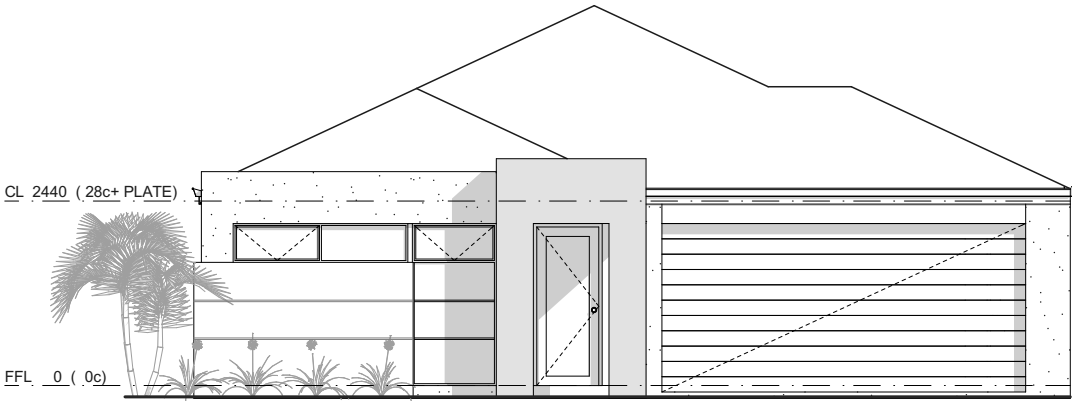
MODERN ELEVATION 1:100